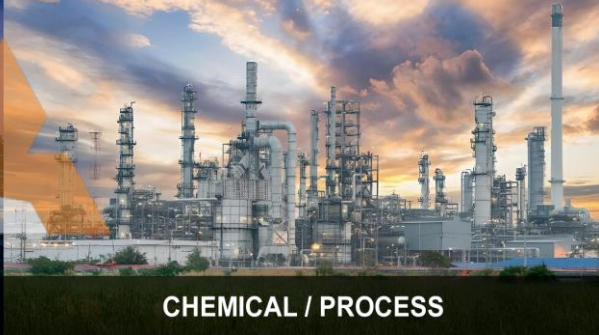
CHEMICAL / PROCESS